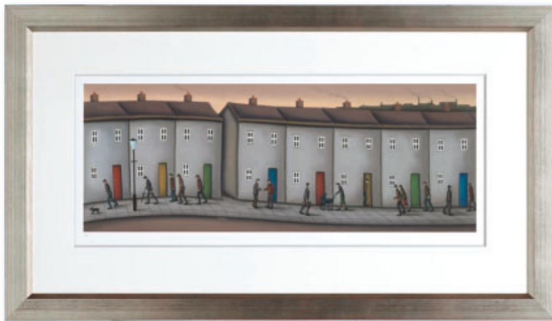
↑ Heart & Soul Giclée edition of 195 Image 11½" x 30" Framed £360